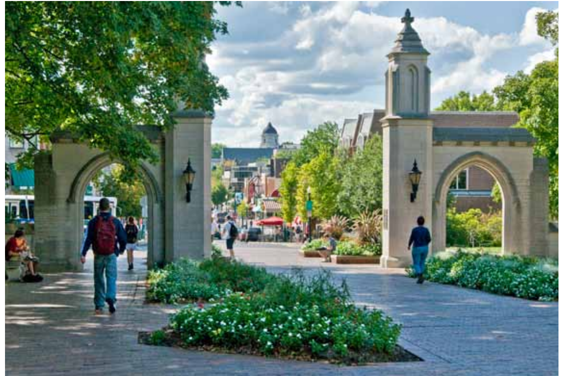
Sample Gates and East Kirkwood Avenue

The campus is spread over 1,933 acres 1 with 520 buildings, encompassing over 15 million square feet of classrooms, laboratories, dorms, offices, athletic facilities, and support spaces. The University also provides 20,639 on-campus parking spaces for visitors, faculty, staff, students, and events. The Floor Area Ratio for campus is 0.18, which is calculated by dividing the total building gross square footage (15,324,204 SF) by the entire campus square footage, or site area (84,201,480 SF).